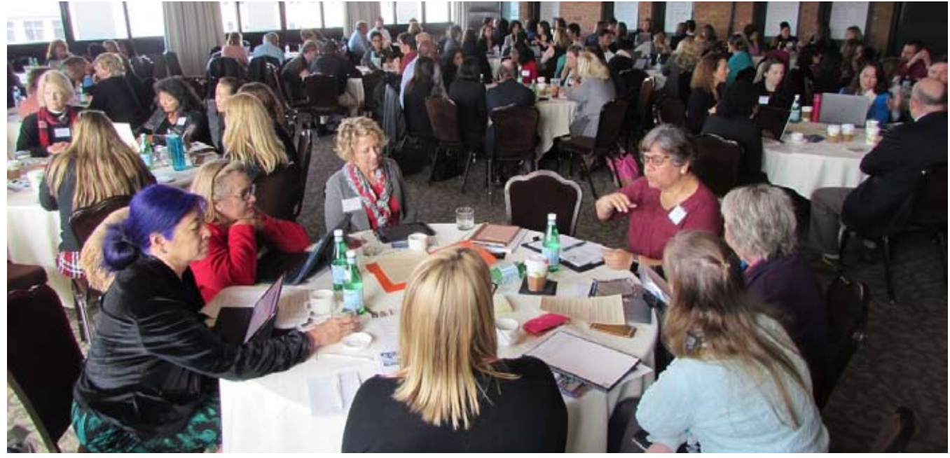
View of attendees at work during the CCTE 2018 SPAN Conference last year at The Citizen Hotel in Sacramento

CCTE Spring 2019 SPAN Conference Coming Up