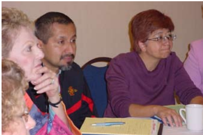
Scenes from the Saturday roundtable discussions at the Fall 2007 CCTE Confence.

Among other topics, many of the discussions focused on the types of data to collect for analysis, and how to collect such data. Additionally, discussions included potential dissemination of information to legislators in order to communicate the effect of assessment in higher education. For more detailed information, look for reports from each of the Roundtable discussion groups which will appear in the Spring 2008 issue of CCNews .