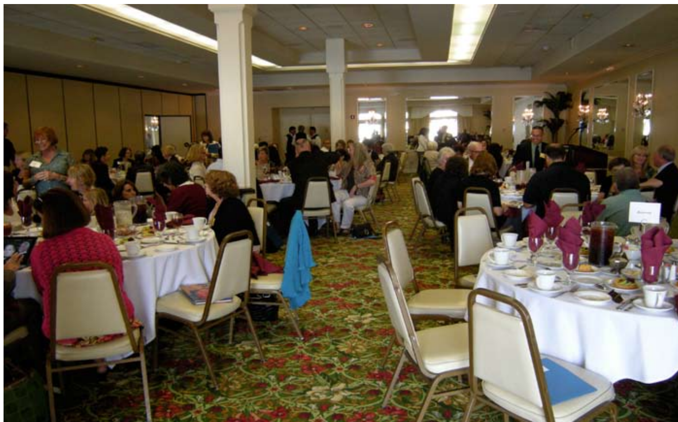
CCTE members and delegates during a session at the Fall 2011 Conference in San Diego.