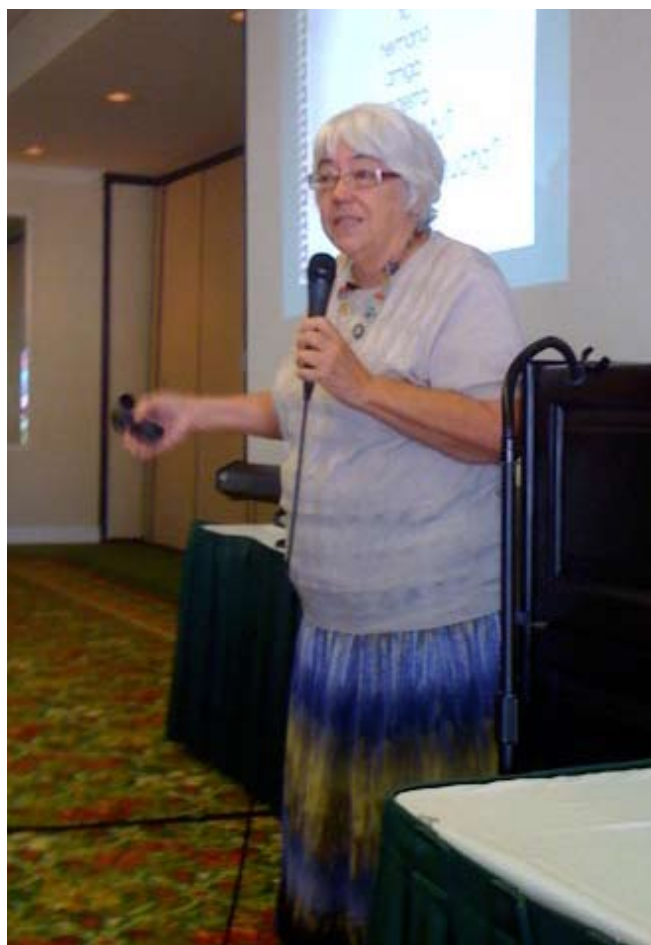
Alma Flor Ada speaking at CCTE Fall 2012 Conference.

Dr. Ada has received several recognitions including the American Educational Research Association Hispanic Research Issues Award for Research in Elementary, Secondary or Postsecondary Education (2008), the California Association for Bilingual Education Life-Time Achievement Award (2008), and a Literary Guild Metal (2006). Dr. Ada continues to shape the terrain in education for teachers, parents, students, and administrators. To this end, Dr. Ada has been