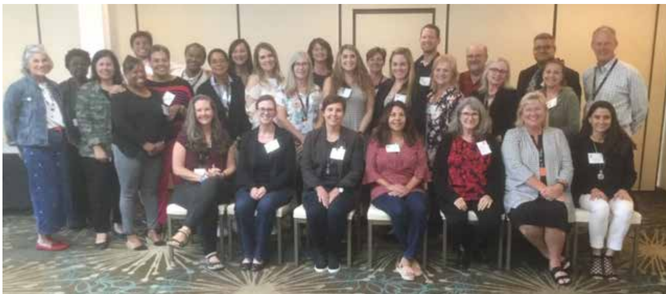
Participants in the inaugural California Clinical Fellows Symposium at the CCTE Fall 2019 Conference.