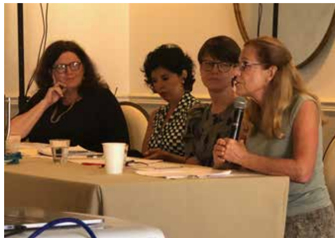
Panel on ECE issues during deans meeting.